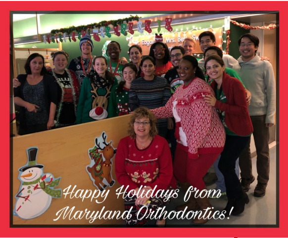
Holiday season celebration. Almost everyone had their season sweater.