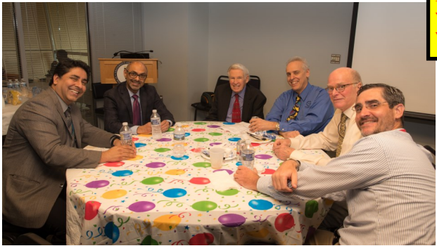
End of the year celebration for the Department of Orthodontics and Pediatric Dentistry.