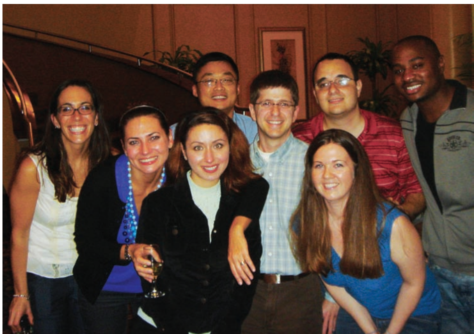
Maryland Endodontics Residents at the Review Course in Philadelphia—September 2008

For more information on giving to the Endodontics Program, please contact the Dental School Office of Development and Alumni Relations, 650 West Baltimore Street, Suite 6207, Baltimore, MD 21201, or call 410-706-7146, or visit us on our website at www.dental.umaryland.edu .