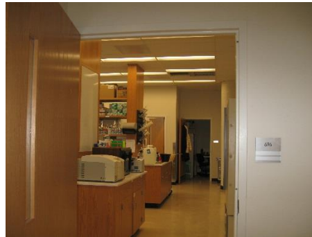
Electron Microscopy Core Imaging Facility