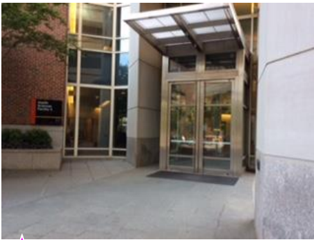
★ Visitor entrance for HSFII