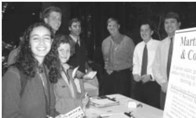
Students visit one of the 20 information booths at Vendor's Night.

On November 6, the Student Dental Association held its annual Vendors' Night in the Medical School Atrium. Approximately 20 companies, ranging from dental labs to financial planners, set up displays in an effort to educate students about the existing products and services that await them upon graduation. With the promise of free samples from the various companies and food provided by the Student Dental Association, approximately 350 students, faculty and staff stopped by to take part in the event.