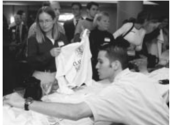
The Class of 2005 sold t-shirts during Family Day.

As is expected, over half of the students graduated from college with a biological sciences